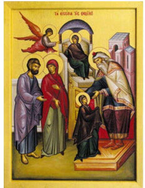
Feast of the Presentation of Theotokos into the temple.

Divine Liturgy Thurs. Nov. 21 st 6:30 pm